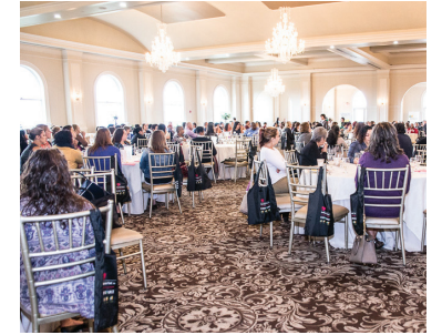
Statewide Energy Assistance Conference attendees.