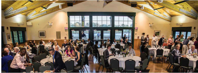
Guests at Operation Fuel's 40th Anniversary celebration.

Since 1977, Operation Fuel has provided nearly $50 million in energy assistance to over 156,000 households throughout Connecticut. This past fiscal year, over 20,000 individuals received energy assistance; almost half were either elderly or children under the age of 18.